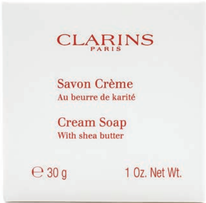
CREAM SOAP IN A CARDBOARD BOX 30 & 60 g