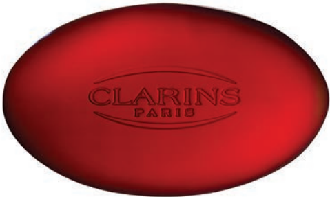
FILM WRAPPED GLYCERIN SOAP 45 g