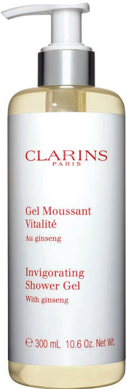
ECOPUMP 300 mL