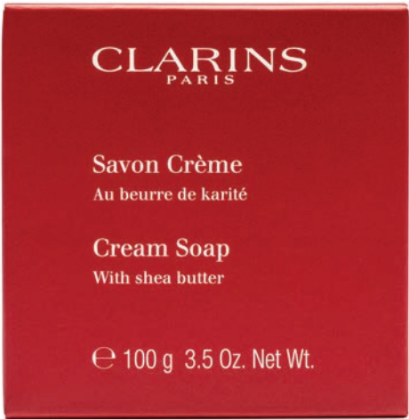
FILM WRAPPED CREAM SOAP IN A CARDBOARD BOX 100 g